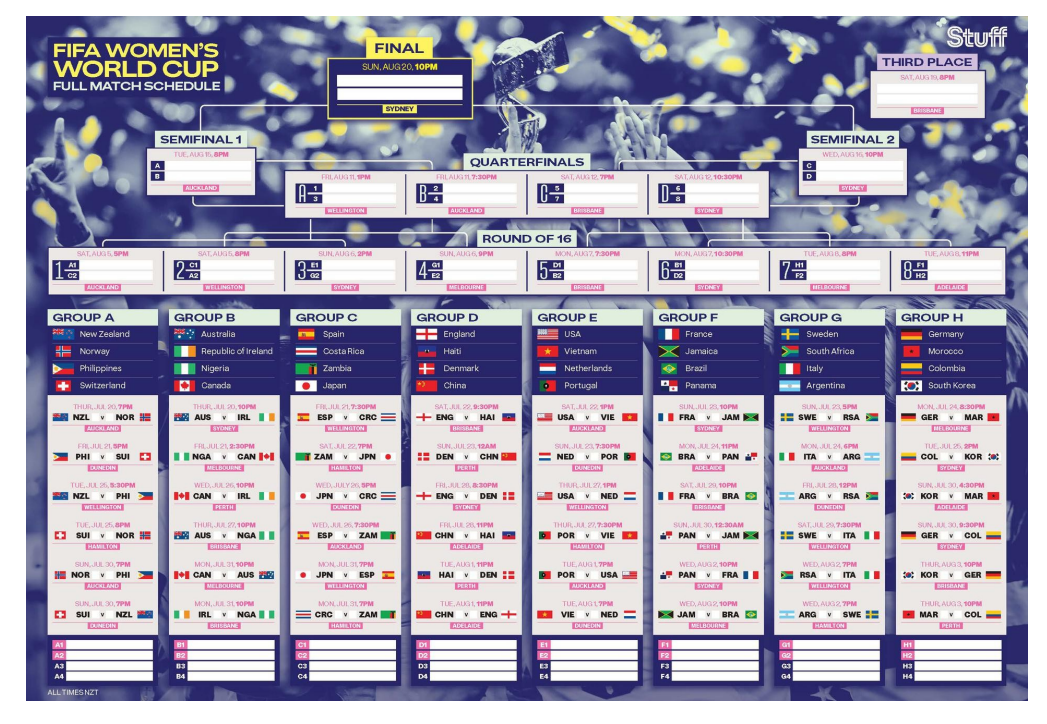
FIFA Women's World Cup 2023™ at Eden Park

Want to know which FIFA Women's World Cup 2023™ games we're hosting here at Eden Park?